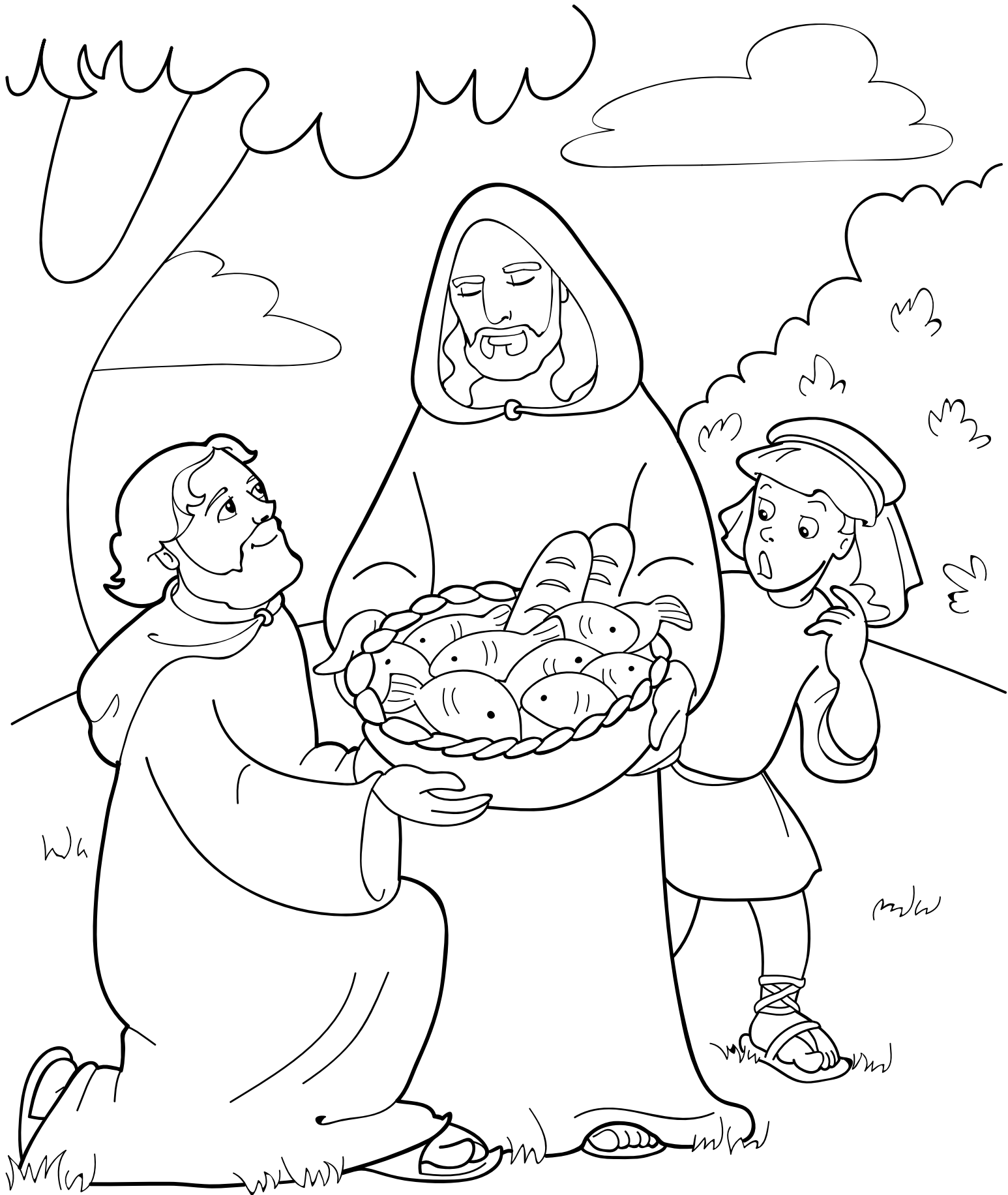
Jesus feeds five thousand people!