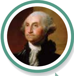
George Washington 1789–1797