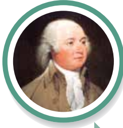
John Adams 1797–1801 Federalist