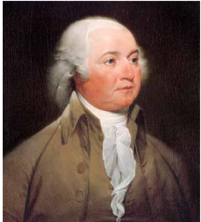
| John Adams was the only Federalist President.

Election of 1800. The election of 1800 was the first that can be described as a fight between