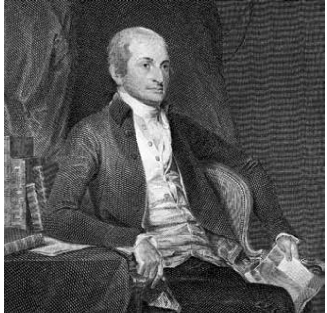
| John Jay, Negotiator with the British

Problem with Britain. During his second term, Washington had to deal with the increasing problems with Great Britain. England still kept possession of several western forts in U.S. territory. It continued to support the Indians there, hoping to use them as a buffer between the U.S. and Canada. As the war progressed with France, Britain began seizing U.S. ships and