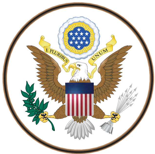
| The Great Seal of the United States