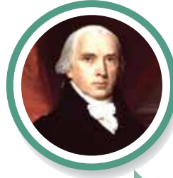
James Madison 1809–1817 Democratic-Republican