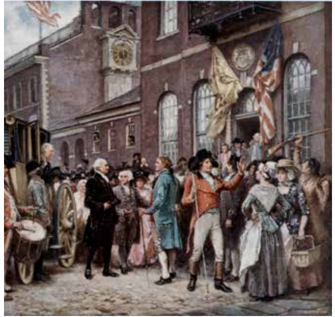
| George Washington's Inauguration

Washington set a formal tone for the new office, mainly because of his own rather formal personality. He would bow, not shake hands, to greet visitors. He dressed richly and drove about in a handsome coach. Visitors could see him during his weekly open house or make an appointment. His wife Martha held a formal