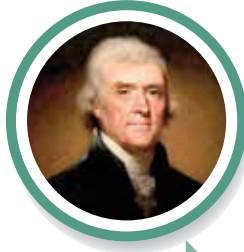
Thomas Jefferson 1801–1809 Democratic-Republican