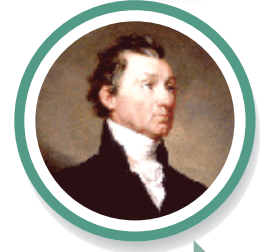
James Monroe 1817–1825 Democratic-Republican