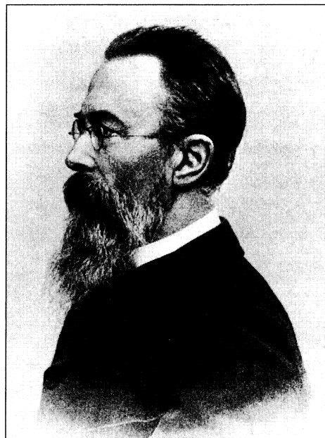
This Composer became Stravinsky's mentor.