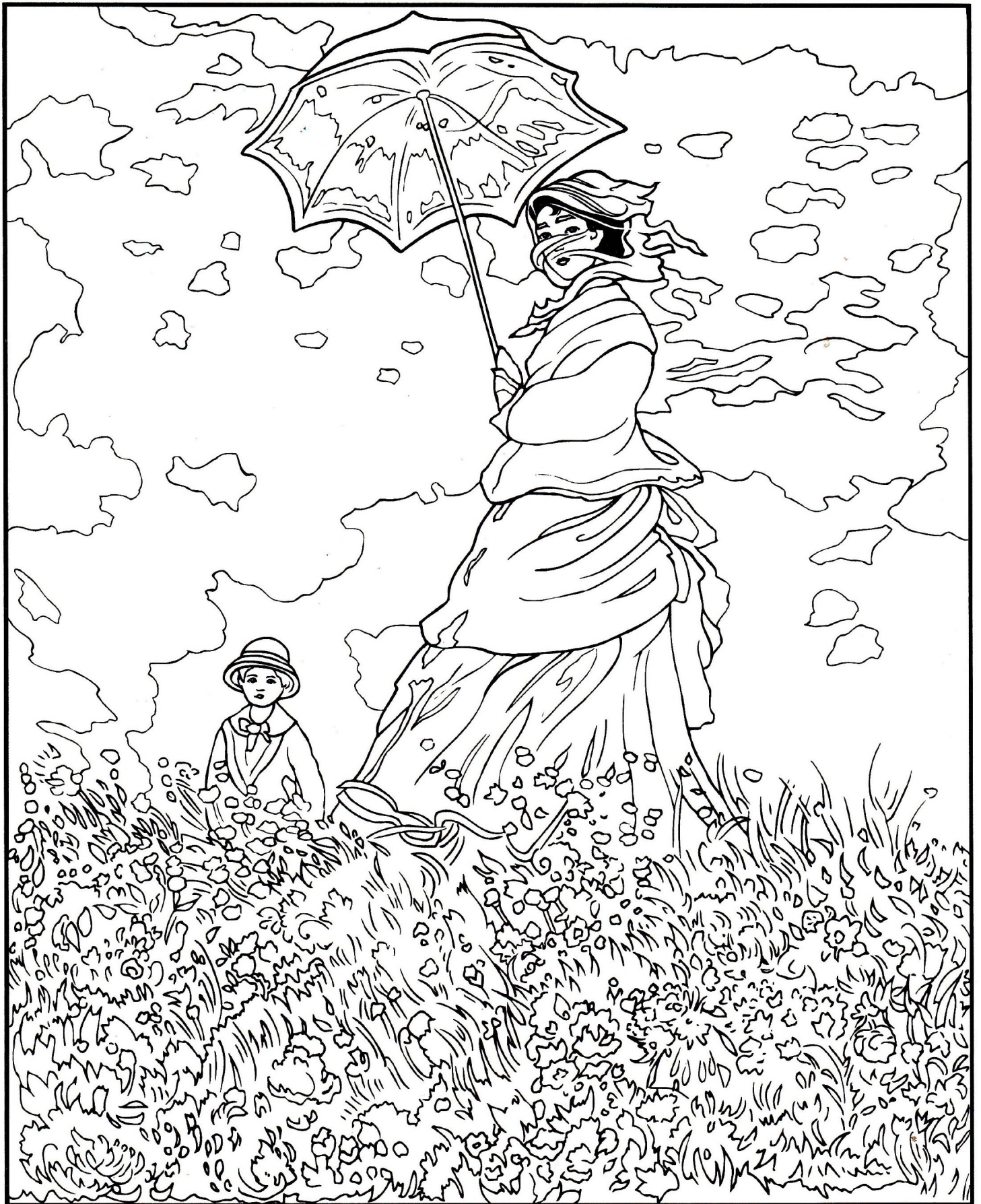
25. Woman with a Parasol, Madame Monet with her Son. 1875. Oil on canvas. 39 3 / 8 in. x 31 7 / 8 in.