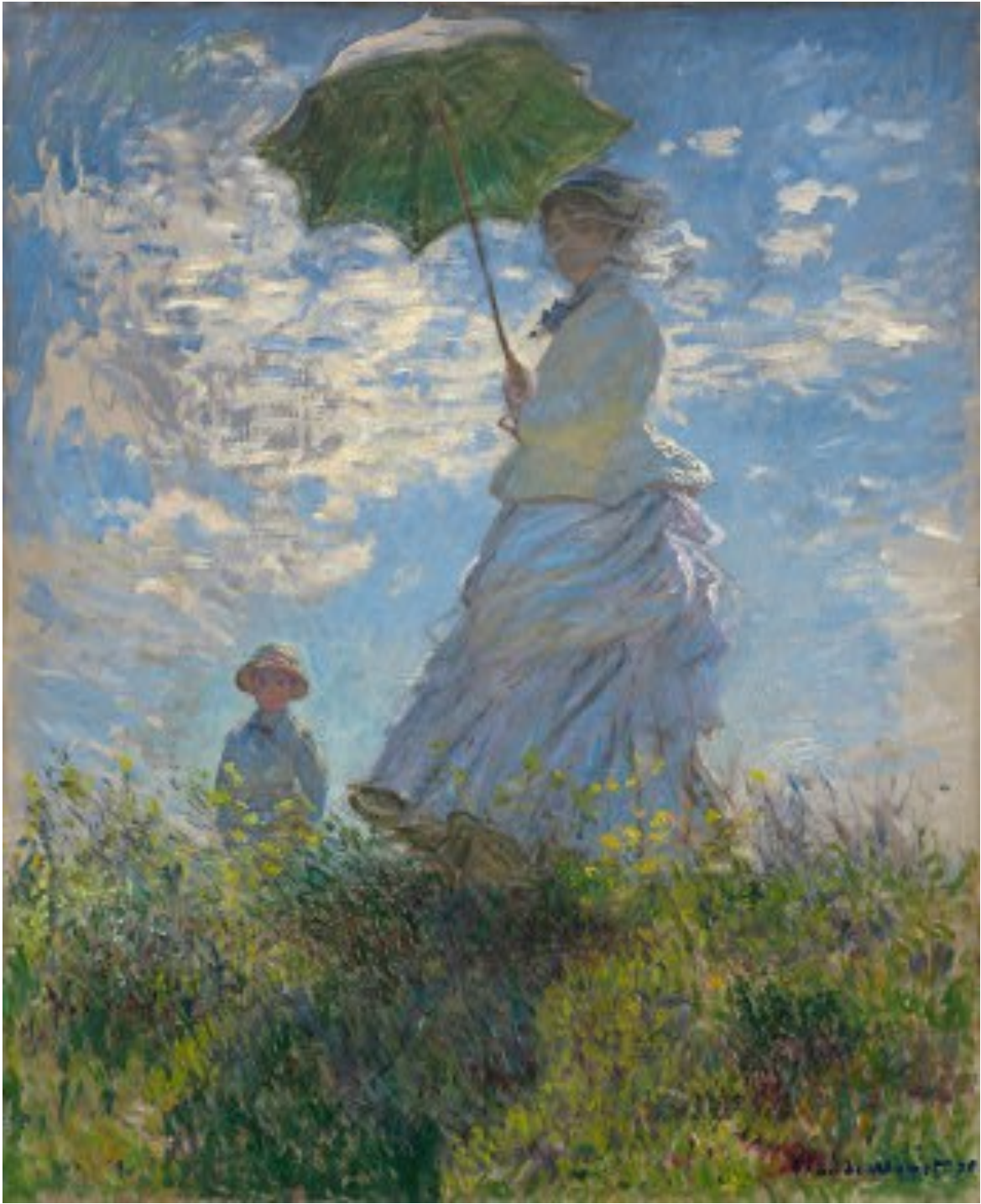
Woman With a Parasol. Claude Monet. National Gallery of Art, Washington, D.C. Oil on canvas.