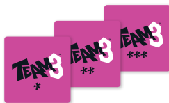
70 Blueprint Cards