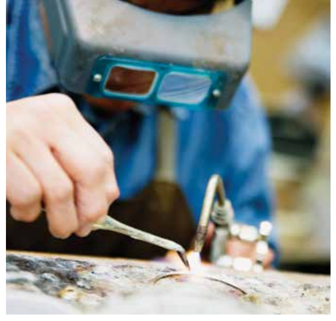
|\; \mbox{Believers are fellow-laborers with God as they build His Kingdom}.