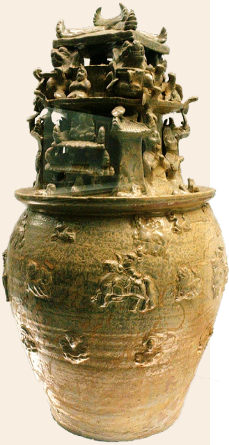
▲ Funeral urn from the Western Jin dynasty