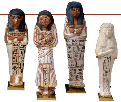
▲ Carved figures found in an Egyptian tomb