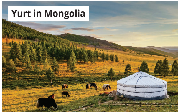
Yurt in Mongolia

The homes you just saw may not look like homes near you. Homes have changed since this time, but people have homes for the same reasons. It is a place where you live. It is also a place where you should feel safe and protected. Let's look at how homes have changed over time.