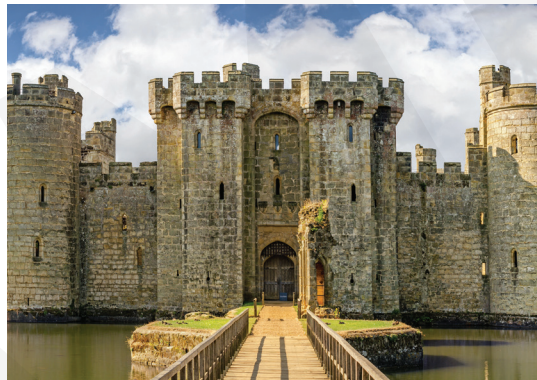
Castle from the 1300s