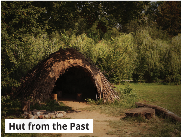
Hut from the Past

Today, some people still build their own homes. Some people buy homes. Others have them built. Many houses have lots of rooms instead of one.