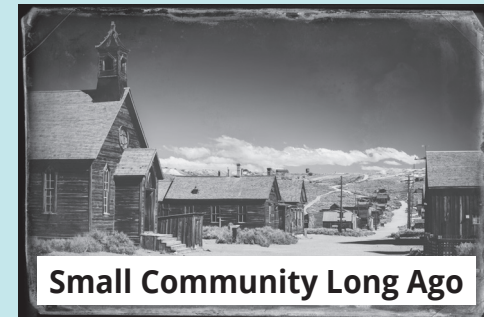
Small Community Long Ago

On another piece of paper, draw a picture of what life would be like long ago. Include what you have learned about homes, jobs, communities, and transportation in the past.