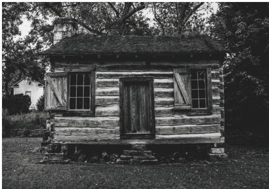
One-Room House from the 1800s

Homes have also changed over time. Homes from the past may not look like our homes today. Look at the pictures below. They show homes built in the past. Pick one of the homes below. Then, answer the following question: How is this home the same and different from your home? Write your answers on the lines below.