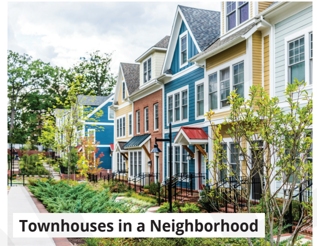
Townhouses in a Neighborhood

Today, many people who have homes stay in one place. They don't move it. Yet some people still move their homes. Some people in Mongolia have homes called yurts. They move them so their animals can find grass and food to eat.