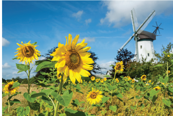
The sunflowers nodded their heads in the wind.

What did you think when you read those sentences? Could any of them be true or literal? Think about when you were very tired or hungry. Can you think of an exaggerated way to say that? Write your answer below.