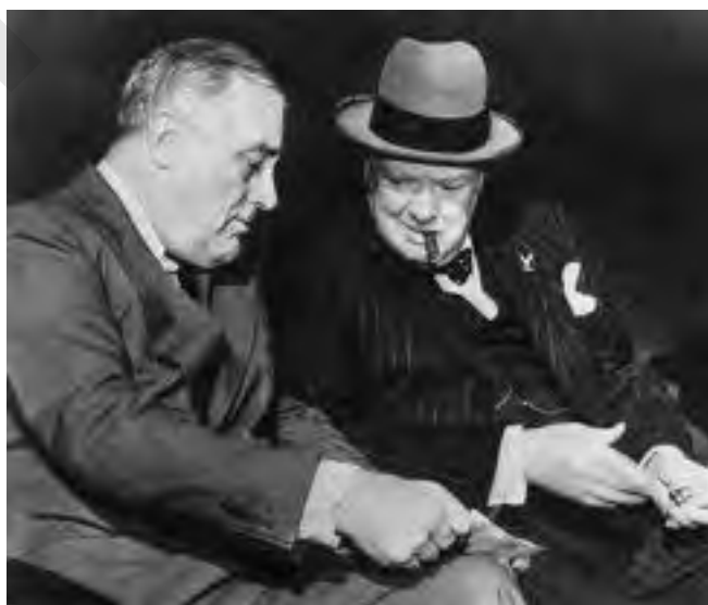
U.S. President Franklin D. Roosevelt and British Prime Minister Winston Churchill.

leadership education integrity doing what is right