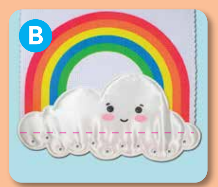
* Add a small amount of glue on back of the cloud as needed.