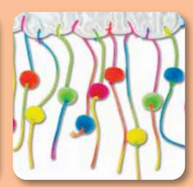
Position them at different levels by sliding them up and down the string. Tie the bottom of each into a double knot.