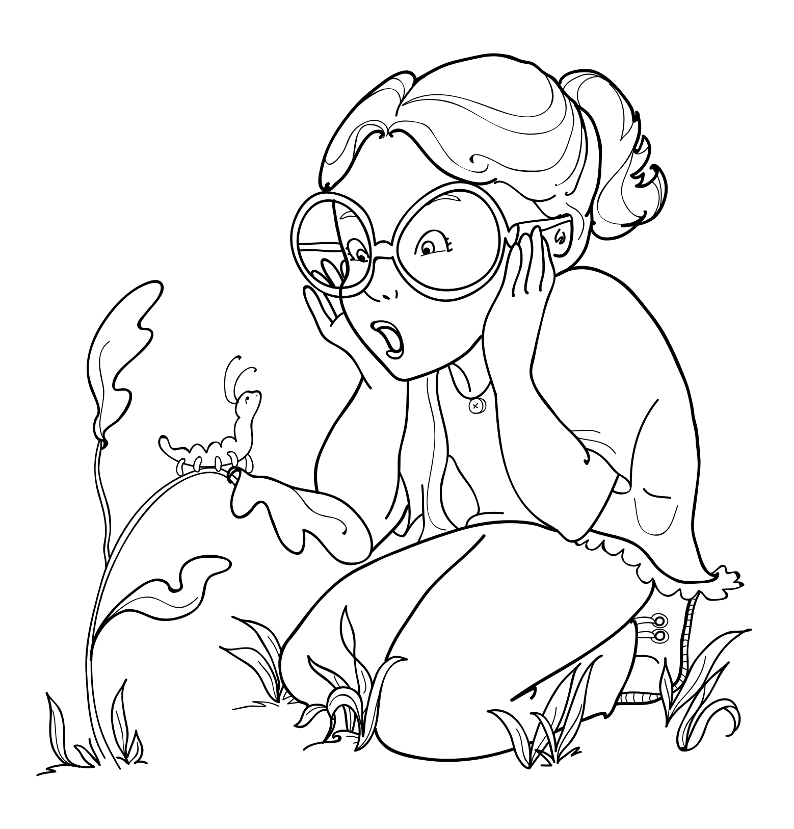
How do YOU see the world?