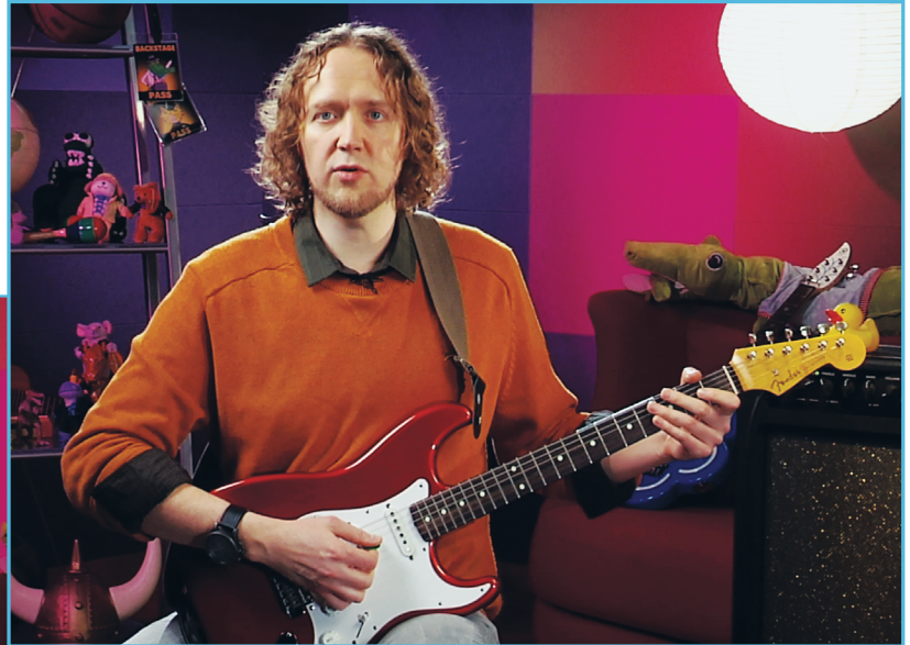
Sitting with guitar on left leg