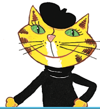
Standing with strap