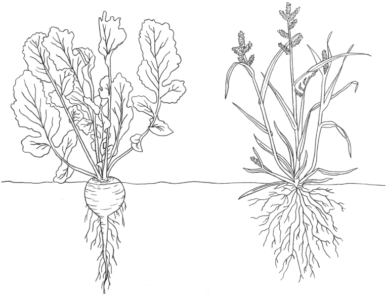
Figure 2: Taproot (left) vs. Fibrous Root (right)

Just like animals and humans, plants need food and water in order to live and grow. Although plants can produce their own food, they must get water by extracting it from the ground. The organ a plant uses to get water from the soil is its roots. Root systems for plants come in two basic designs.