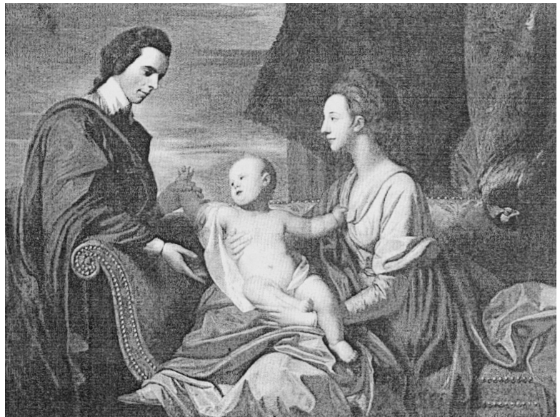
In 1776 Arthur Middleton (left), of South Carolina, owned more than 50,000 acres and 800 slaves. He also signed the Declaration of Independence.

—THOMAS JEFFERSON TO ALBERT GALLATIN, 1807