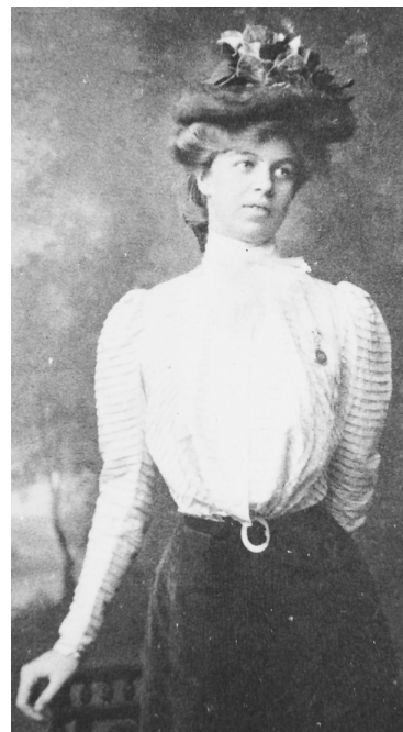
Eleanor smartly dressed for European travel on a school vacation.

The child who had not always told the truth, who had struggled against the demons that make people lie, was becoming the kind of person her father had wished her to be. For the rest of her life, Eleanor Roosevelt would be known for her truthfulness.