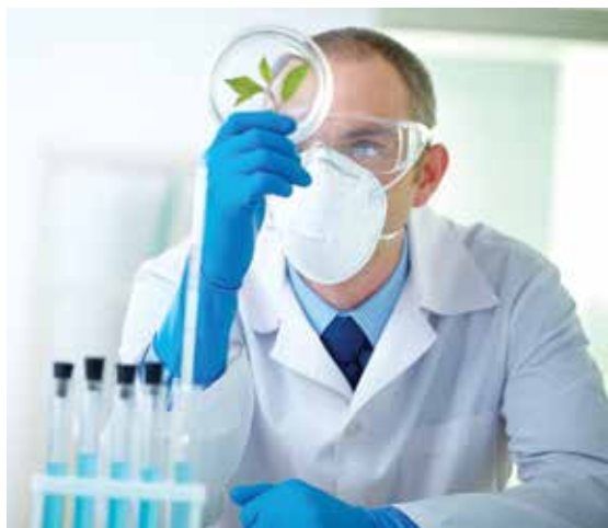
Botanists are scientists who specialize in the study of plants.