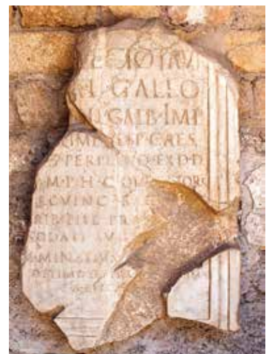
This is a Latin inscription on an ancient stone.

As it is with all sciences, you will learn the special vocabulary for the field of botany. Most often, the words you will learn come from Latin or ancient Greek languages. Since those languages are no longer spoken, they are great choices for science words. That's because the meaning of the words will never change. You see, in languages that are still in use, meanings change quite a bit. For example, many years ago, the word awful meant something that inspired a sense of awe. However in the language of our day, the word awful means something that is terrible. And we now use the word awesome to mean a sense of awe. So that's why you will find a lot of Latin and Greek words in science. They don't change and you will never be confused about what they mean. Don't worry about remembering all the vocabulary words you learn. The most important thing is that you develop a strong understanding of the science of botany and build memories of your learning through lots of hands on experiences. Nevertheless, I am going to teach you a lot of new words this year. Let's take a look at some of these special words and find out more about the science of botany.