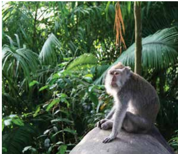
All animals that live in the rainforest depend on plants for survival.

must eat, the medicines that make us well, and many other items we use every single day. In fact, this book you are reading is made from plants! And let us not forget that plants also make Earth a more beautiful place to live. Imagine a world without any plants. What would you eat? Think about that. Did you know that virtually everything you eat is either a plant or something that depends on plants for survival?