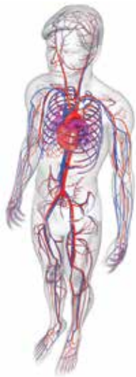
Inside your body are tubes filled with blood.

You're probably trying to imagine tubes in a plant and what they look like. Do you think you might have tubes inside you? Look at your wrist. Do you see blue streaks? Those are tubes called veins (vaynes). They contain fluid. What do you think that fluid is called? It's called blood, of course! You see, then, that you and I are vascular, similar to vascular plants!