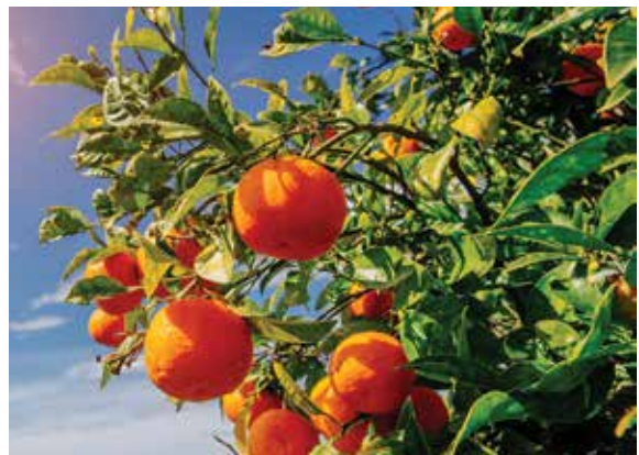
Humans are dependent on the food crops that farmers grow such as this orange grove.

Botany, as you probably know, is the study of plants. It is one of the most important fields of science in the whole world. Why? It’s because our very survival depends on plants. You see, plants produce the air we need to breathe, the food we