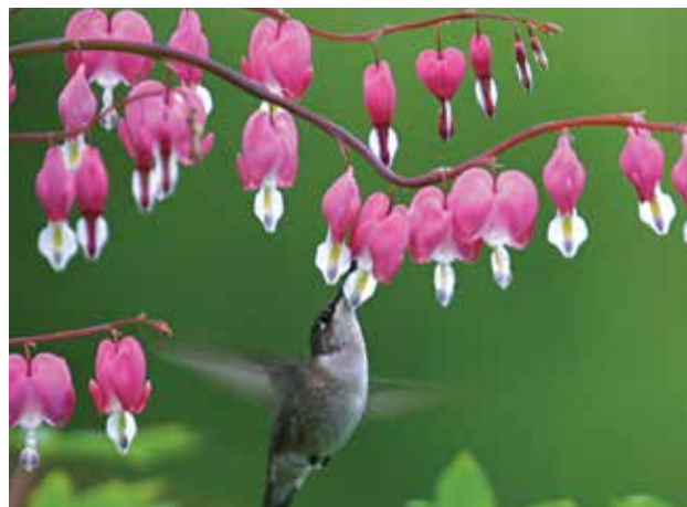
Birds will feed on the nectar in these bleeding heart flowers.

Now let's learn about nature journaling and get started on our scientific studies.