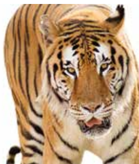
Kingdom Animalia includes all the animals

living things that biologists have spent a great deal of time separating them into different groups, called kingdoms. This helps biologists keep things organized. They've put plants in one huge group, called the plant kingdom, or Kingdom Plantae (plan' tay). They've also put mushrooms and other similar growths in their own kingdom called Kingdom Fungi . We will study these two kingdoms this year. But there are other living things, aren't there? Can you think of a living thing you've seen recently? You might have mentioned some kind of animal. Maybe next year you will begin studying the creatures in Kingdom Animalia (an uh