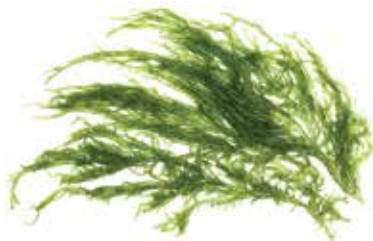
Kingdom Protista includes algae