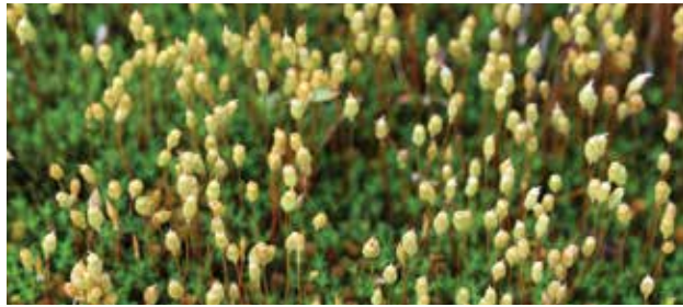
These moss spores are tiny because they don't contain food for the baby plant.

Even though seeds and spores both grow into plants, spores are not seeds. You see, a seed is