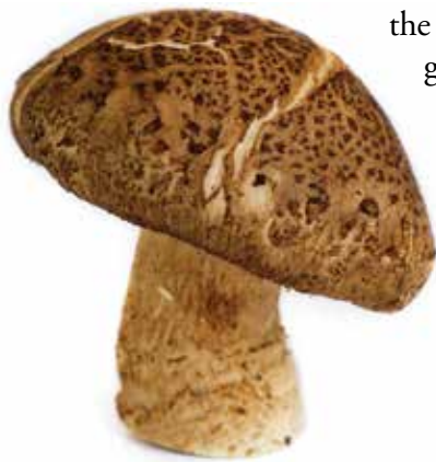
This mushroom is a fungi.

But botany isn't all we have planned for this year. In addition to learning about plants, you'll also learn about fungi (fun' jye). What on Earth are fungi? Have you ever seen mushrooms growing outside? They are fungi. Because fungi also grow outdoors alongside plants, sometimes even helping plants, we're going to take one lesson to dive into the fascinating world of fungi. I think you'll find this special creation of God quite interesting.