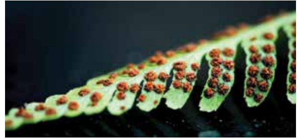
Each of the clumps on this fern contains millions of spores.

a very special plant package. It contains a baby plant, food for the baby plant, and a protective covering. You can think of a seed as a baby plant in a box with its lunch. A spore is just the baby plant and a protective coating. There is no food for the baby plant. Since there is no food in a spore, spores are much smaller than seeds. They also need extra special conditions to grow. We'll learn all about that in a later lesson.