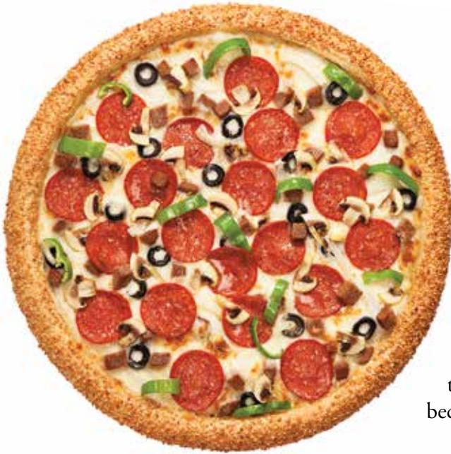
This pizza could not exist without plants.

By understanding the secret world of botany, you'll become an expert on what it takes to grow and nourish plants and help them flourish in this world. When you're done with this first lesson, you will create a special structure called a light hut that's designed to grow plants from seeds any time of the year. You can plant any seeds you want, but I recommend herbs if you're starting in the fall because herbs can be grown indoors through the winter. If you are beginning the spring, plan for fruits and vegetables because you'll be planting an edible garden outside! That means you'll grow food like strawber-