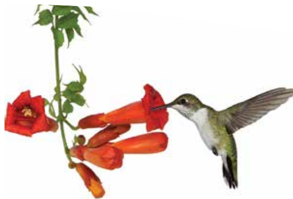
The design of these flowers is perfect for giving the hummingbird food.

As you journey through this book, you'll learn about seeds, soil, roots, leaves, flowers, creatures that help plants grow, trees, and so much more. You'll do projects like create a miniature indoor greenhouse called a light hut and make a field guide of plants in your area. You'll do experiments with plants, like changing the color of flowers. You'll also record what you learn in your Botany Notebooking Journal. Today, you'll make a special book called a nature journal and, like a true scientist, you will record your scientific observations of the outdoor world on its pages. I think you'll enjoy digging into the natural world of plants and fungi, don't you?