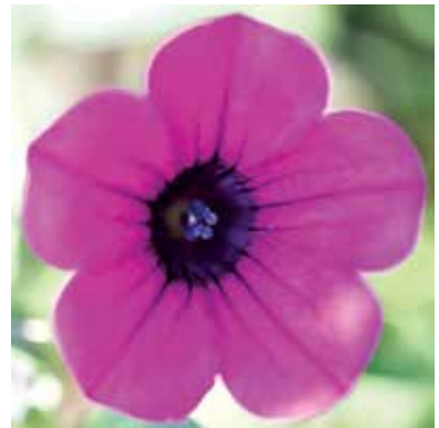
Each part of a vascular plant, even the flowers, has tubes that transport fluid.