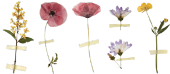
Press flowers for several days between two heavy books to flatten them before adding them to your nature notebook.

Very occasionally, and with your parents' approval, you can include in your nature journal samples of the leaves and bits of nature you find outdoors (as long as they are not too bulky). However, be careful not to disturb too much of nature when taking a specimen. You wouldn't want to remove the only flower in a field. You could disrupt the natural cycle of that plant's growth.