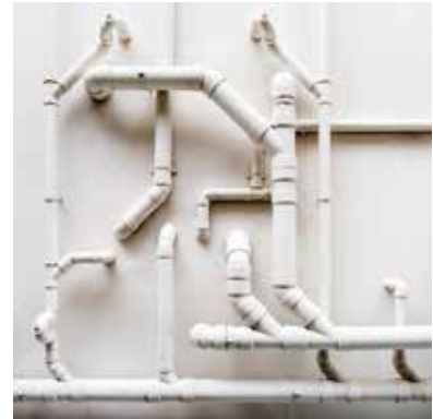
Behind the walls of your house are pipes and tubes where water and gas flow.

Look at the leaf in the picture. Do you see the veins? These veins carry water and other important nutrients throughout the plant. Although you can actually see many of the tubes in a plant by just looking at its leaves or flowers, many are also hidden inside the plant and are hard to see. That's the way it is with the tubes inside you, too!