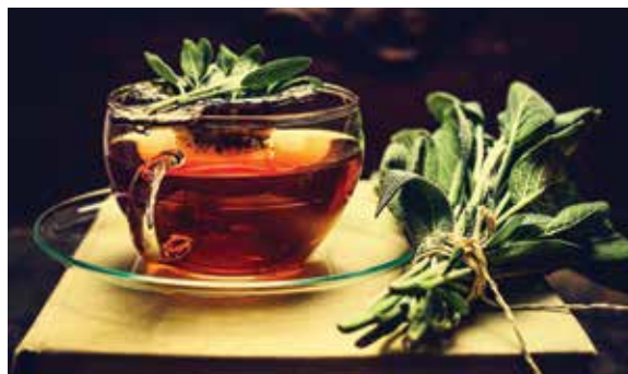
For thousands of years, herbs have been used for healing as in this sage tea.

So what do botanists actually do? Well, have you ever taken medicine that healed you of an illness? Some botanists study plants that are used to make medicines that cure diseases. In fact, many different medicines are made from plants. Before modern medicine, people relied on healers that knew which plants helped to cure which diseases. They weren't officially called doctors, nor were they called pharmacists. But they were actually both. A doctor figures out what's wrong and then prescribes medicine that a pharmacist prepares for the patient. Many years ago, the healer figured out the problem and prepared the medicine using mostly plants. For example, if someone came down with a bad cold, a healer might make a tea from the sage plant. Sage is an herb that has many healing properties. Not only does it help with colds, but it also fights bacteria and helps with breathing problems. In fact, its scientific name is Salvia Officinalis , a word that means, "The plant saves people."