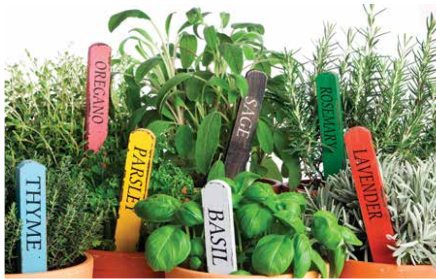
Herbs are easy to grow indoors and can be used for cooking.

fruit of the tomato plant. Several other fruits and vegetables add to the taste and flavor. But what about the pepperoni? It's made from pork and beef. Pork comes from a pig, and beef comes from a cow. Well guess what. Pigs and cows eat plants. Without plants, there is no pork and beef. Indeed, almost every animal you eat—such as a chicken and fish—lives on plants. Now, of course, some people eat alligators, frogs, and such. However, even though those animals eat other animals, and the animals they eat actually live on plants. So it all comes down to plants. We need them. And we should learn as much as we can about them because they are a vital part of life on Earth.