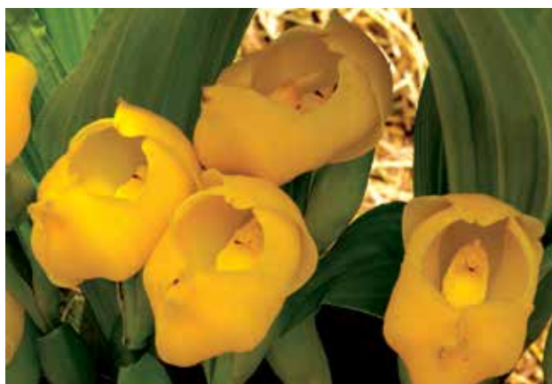
This cradle orchid is sometimes called a swaddled baby orchid.