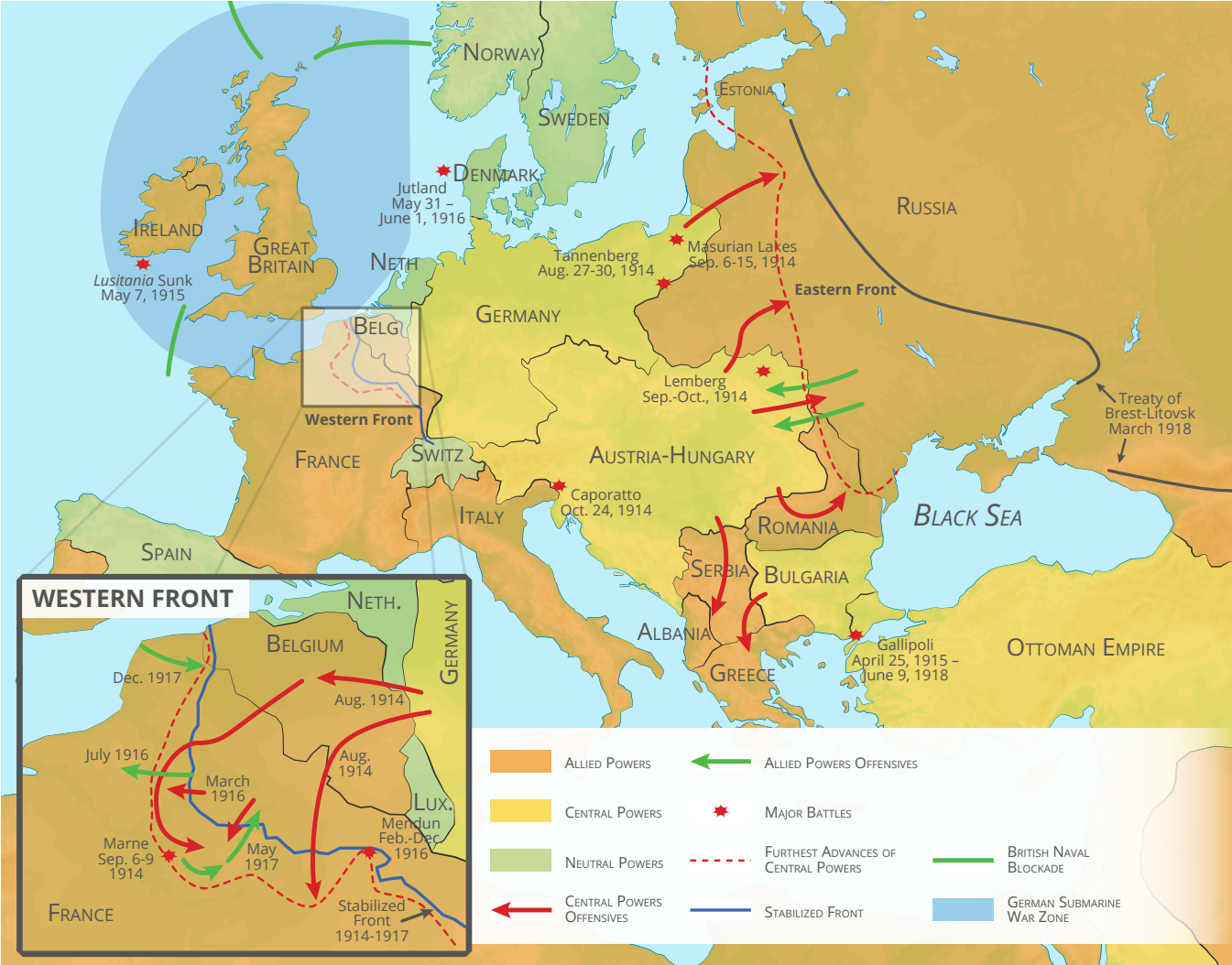
| World War I battle fronts

Austria's declaration of war initiated a chain reaction among European nations because of the previously negotiated alliances throughout the continent. Russia, pledging to aid the Serbian government, refused to stop her mobilization in defense of the Serbs