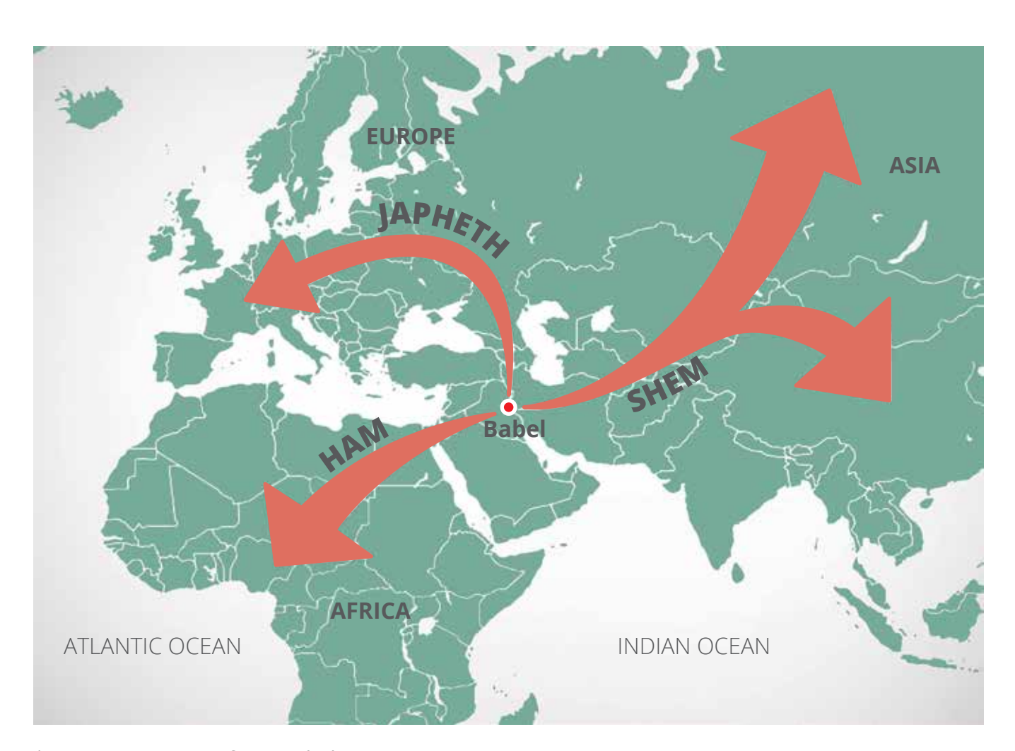
Migration Routes from Babel

God knew that their plan to build such a oneworld city was a challenge to His authority.