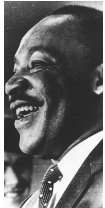
After he grew up and became famous, Martin Luther King, Jr., wasn't often seen laughing in public. But he had a great sense of humor and loved to tell jokes with friends.