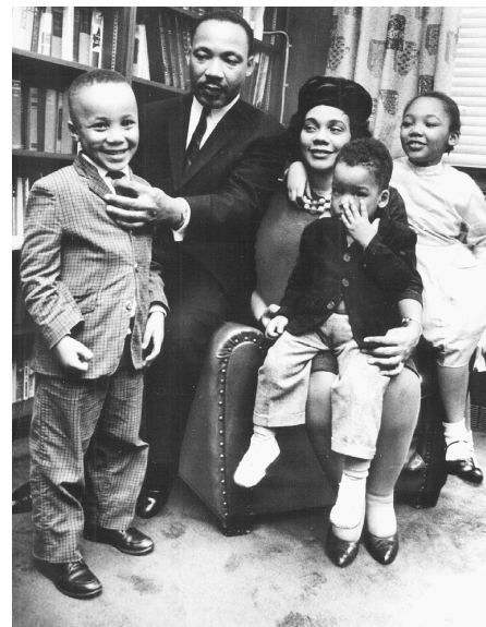
Martin Luther King, Jr., met Coretta Scott in Boston, where she was studying singing. This photo shows them with three of their four children in 1963, the day after an Atlanta school refused to admit their son Martin Luther III (left).

King was muscular, energetic, and ambitious, with a zest that attracted people. In Atlanta he worked on the railroad and discovered that what he really wanted to do was preach. So he did that, on Sundays, in small Baptist country churches. Then he learned of a girl, Alberta Williams, who was the daughter