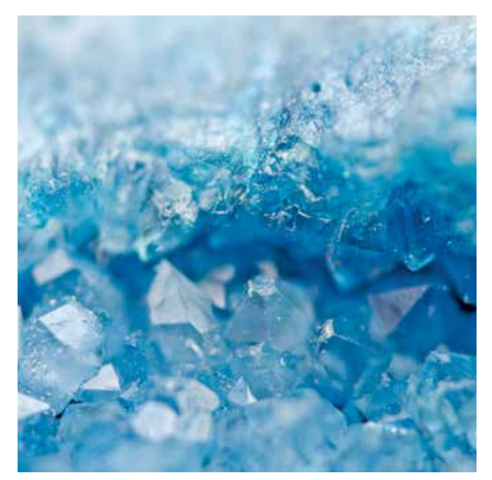
| SiO, crystals

Only in metals are solid solutions relatively common. The atoms of one element may enter the crystal of another element if their atoms have similar