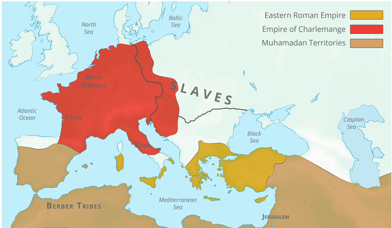
| Islamic Empire A.D. 737

Differences arose, especially over the date of Easter, leading eventually to the Synod of Whitby in 664. At this synod the north agreed to accept the Roman rather than the Irish Christian beliefs.