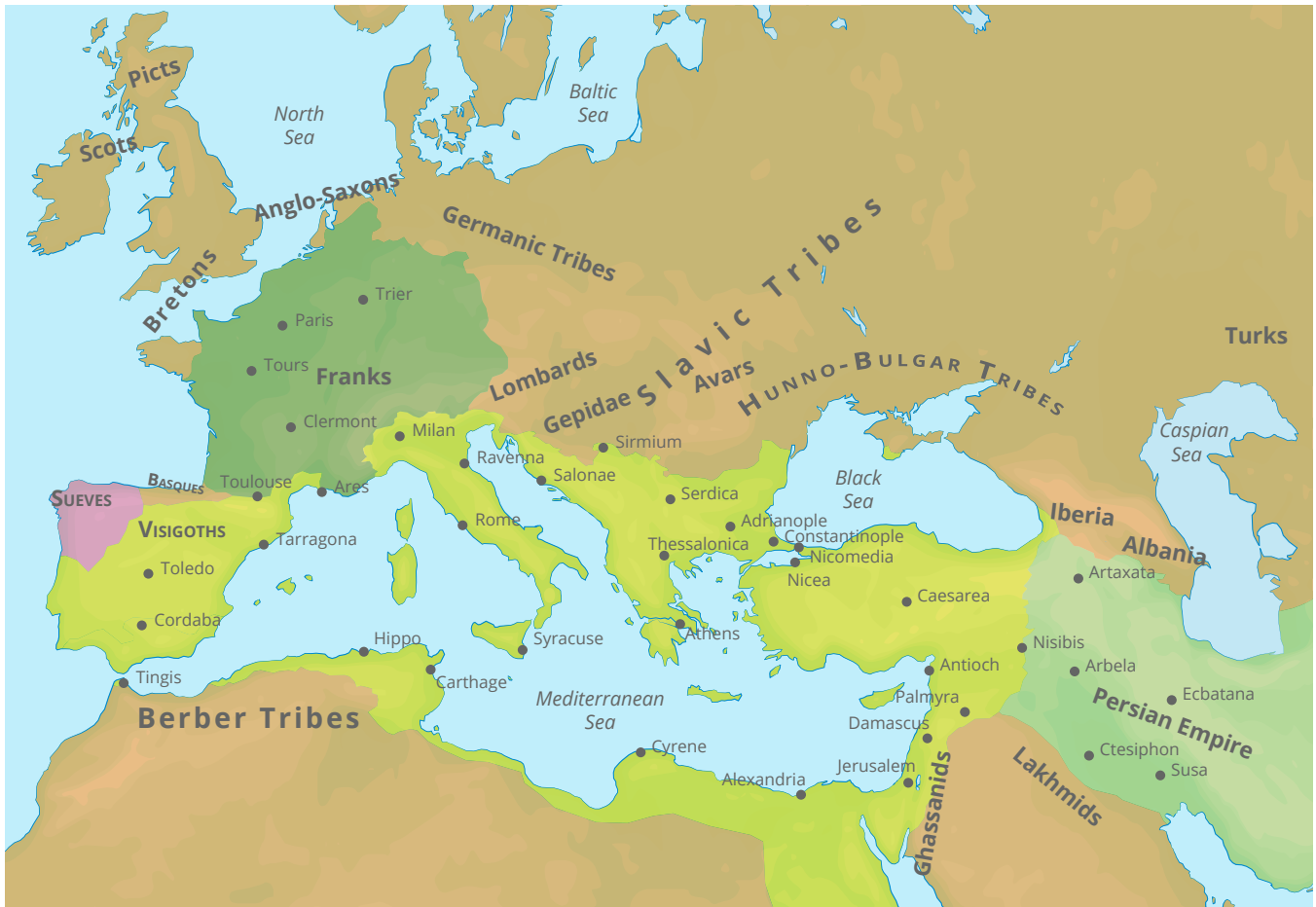
| Eastern Roman Empire of Justinian A.D. 562