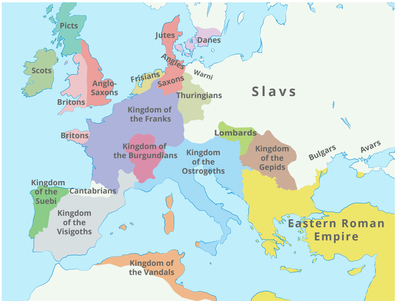
| Barbarian Kingdoms about A.D. 528

the fall of Rome. Many were Arian Christians, believers in the Arian heresy.