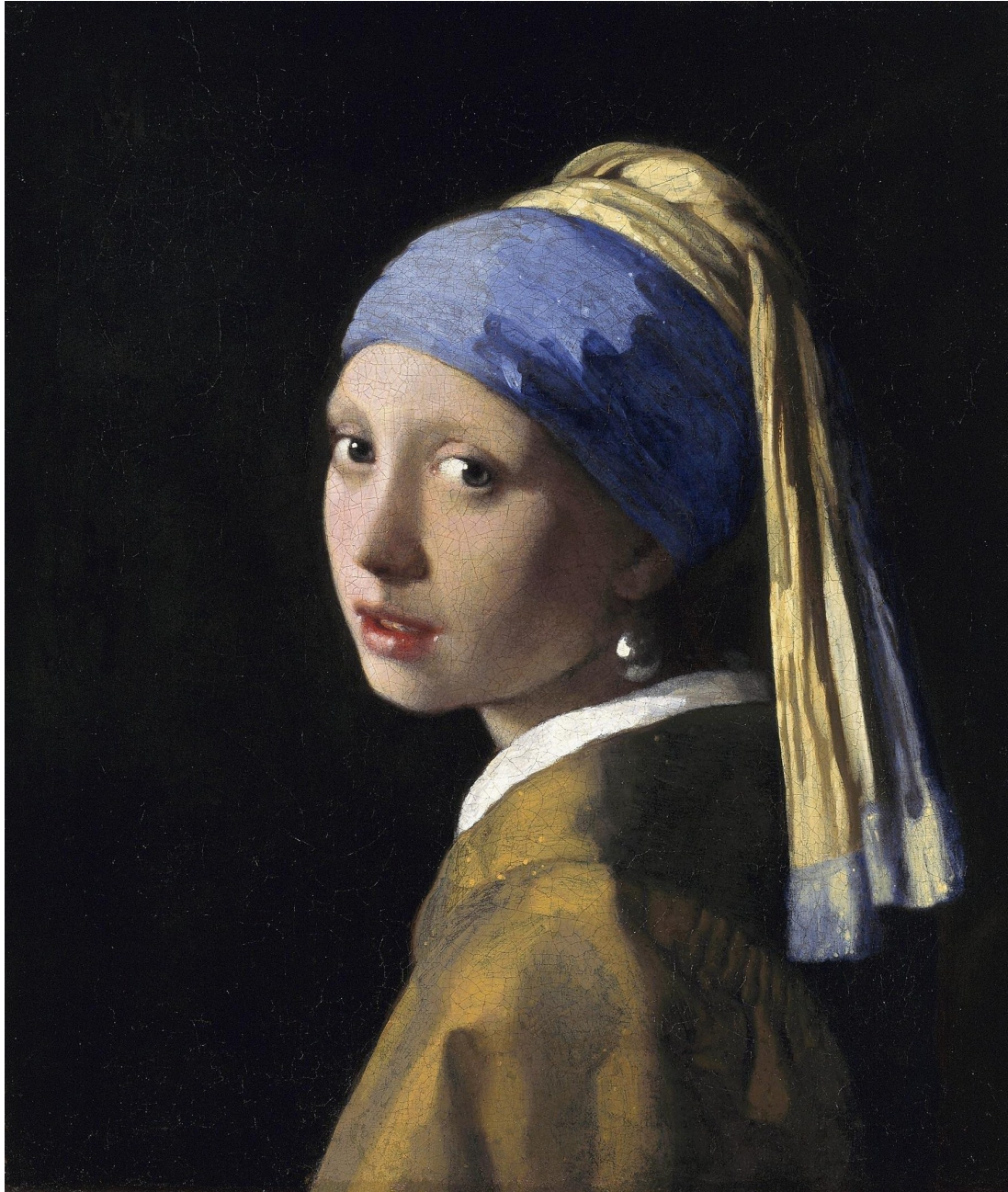
Girl With A Pearl Earring. c. 1665.

Oil on Canvas. Mauritshuis, The Hague, Netherlands.