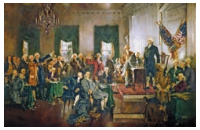
| Signing of the U.S. Constitution

in many public schools to offer prayers or to read passages from the Bible; this practice was exercised on every possible basis, ranging from wholly voluntary and intermittent action by individual teachers to a uniform requirement prescribed by state authorities. For years the Supreme Court avoided a direct decision on the constitutionality of these practices, but in 1962 the justices invalidated a school prayer requirement and any requirement in public schools of Bible reading or recitation of the Lord's Prayer, stating, "In the relationship between men and religion, the State is firmly committed to a position of neutrality ." Although the "neutrality" rulings succeeded in banning public funds for parochial school