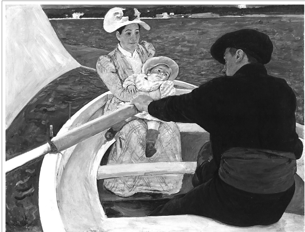
Figure 39 The Boating Party , 1893–1894 Mary Cassatt

where their health might improve. Some stories of her life assume that the family was wealthy. This is not altogether true. While they were better off than many Americans, her father was not always successful in his business dealings. Living in Europe allowed them to live better than they might have in America.