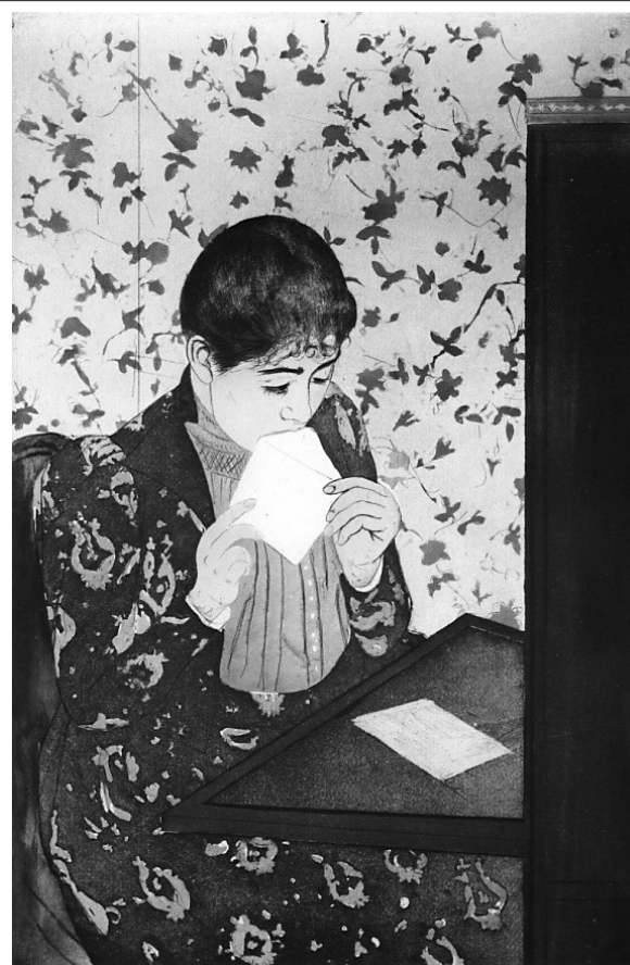
Figure 40 The Letter , 1891 Mary Cassatt

find paintings by the best artists for his private collection. She also bought a number of paintings for herself. Since she knew Americans who were visiting Europe, many of whom were wealthy, she could advise them in their collections of art. When these paintings were brought back to America, more people could learn about some of