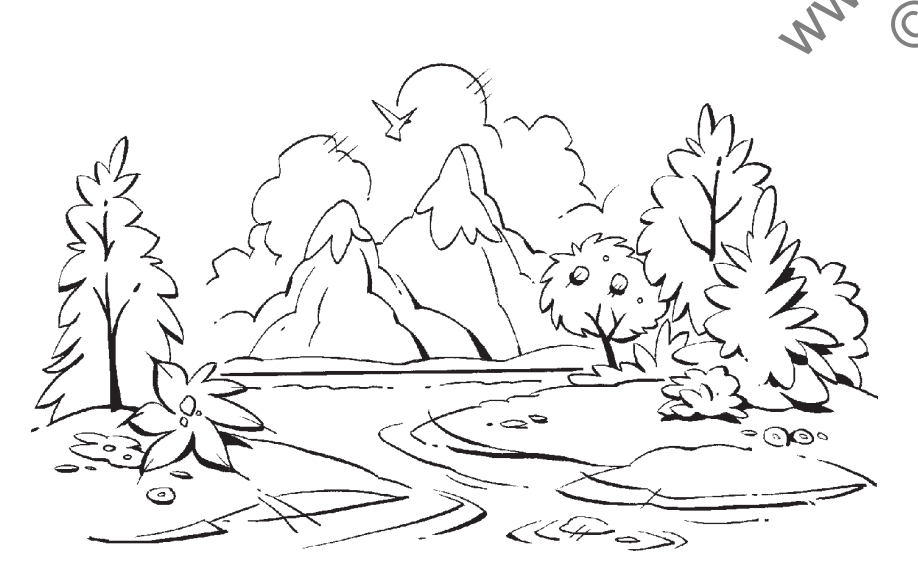
God made all things.