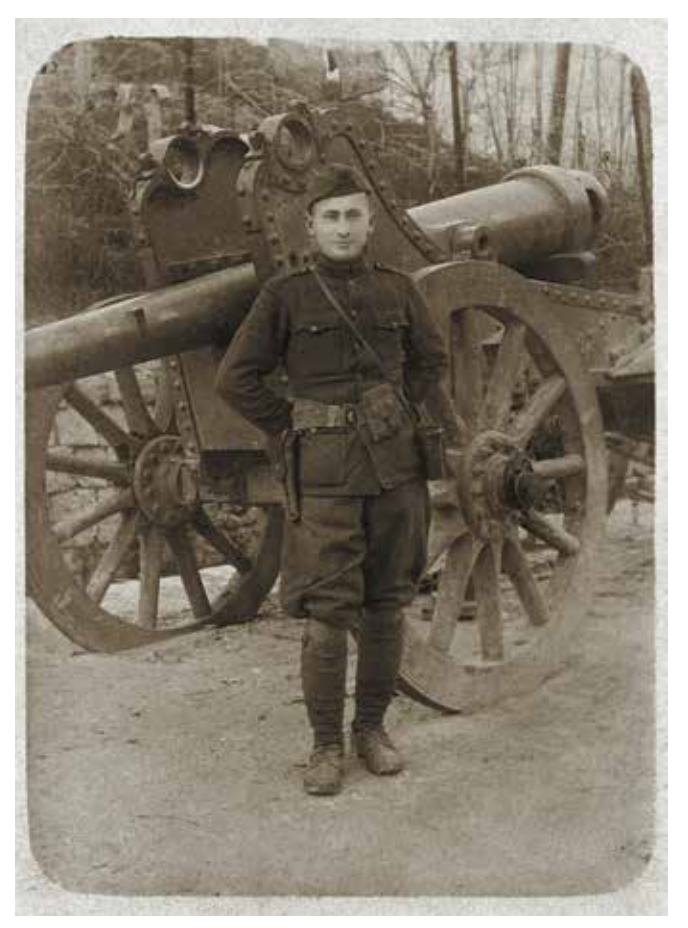
A soldier from World War I

Germany's drive through Belgium to attack France succeeded. Although not altogether