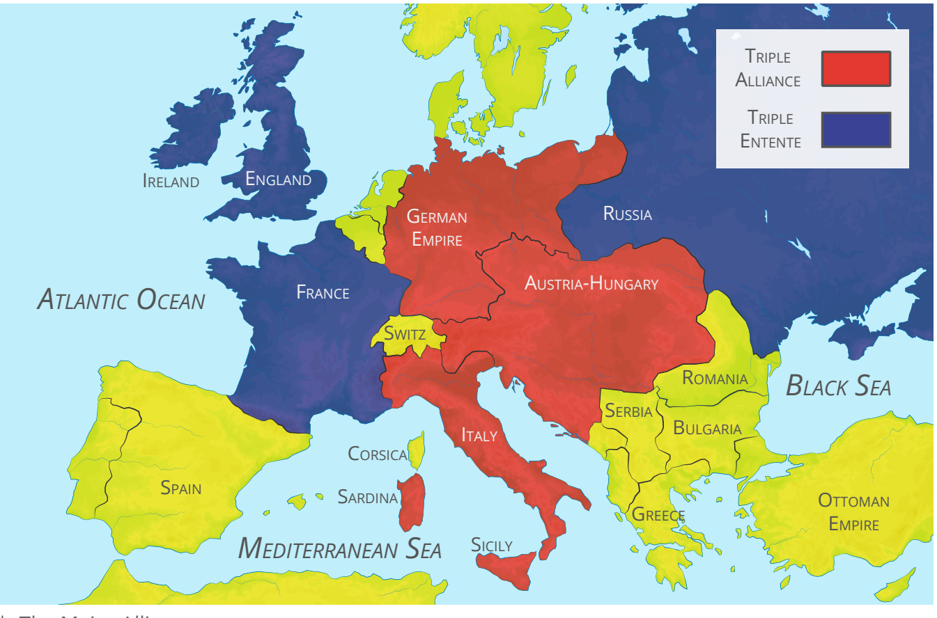
| The Major Alliances

Wilhelm proceeded to destroy all that Bismarck had worked to achieve. Abrasively and with little sensitivity in foreign relations, Wilhelm