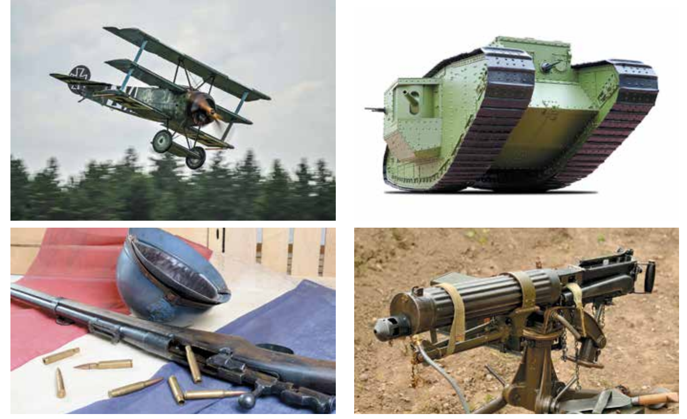
Weapons of World War I ( from top left clockwise )- a Fokker Dr. I used by the German Empire, A British Mark V tank, A Vickers Machine gun, and a Berthier rifle and steel Adrian helmet used by French forces.

The long war was over. A withdrawal of German forces began immediately, closely observed by Allied troops. The task ahead was also immense—the writing of a lasting peace.