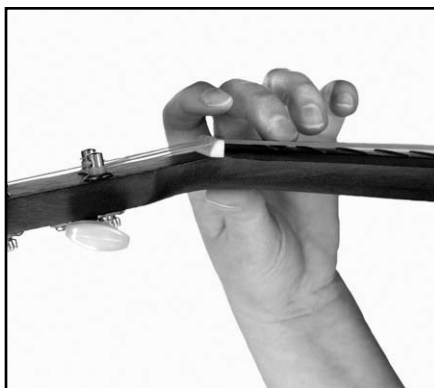
Like gently squeezing a ball between your fingers and thumb.