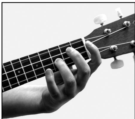
Keep elbow in and fingers curved.

Learning to use your left-hand fingers easily starts with a good hand position. Place your hand so your thumb rests comfortably in the middle of the back of the neck. Position your fingers on the front of the neck as if you are gently squeezing a ball between them and your thumb. Keep your elbow in and your fingers curved.