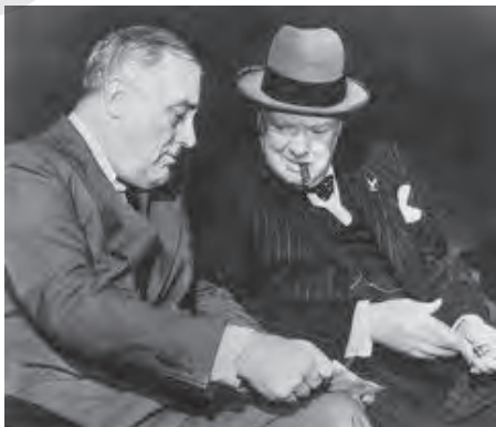
U.S. President Franklin D. Roosevelt and British Prime Minister Winston Churchill.

leadership education integrity doing what is right