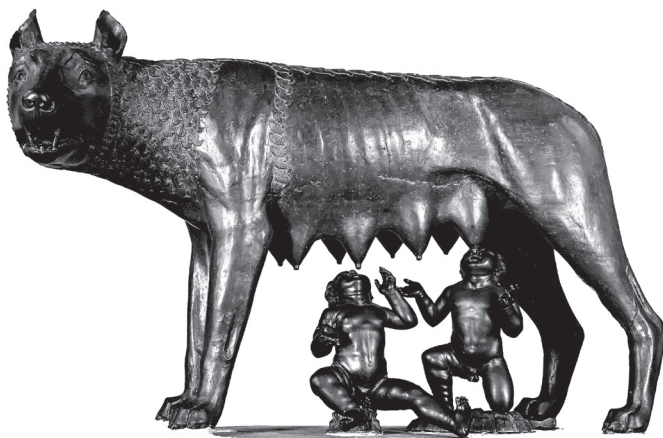
Romulus, Remus, and the She-wolf Capitoline Museums, Rome

This iconic statue of the ancient city of Rome depicts the twin brothers, Romulus and Remus, suckled by a she-wolf. The myth that the Romans were descended from ancestors so fierce and courageous they were raised by a she-wolf fits the national character of Rome, a city chosen by destiny to conquer and rule the world. Romulus founded Rome and became her first king, giving Rome its name.